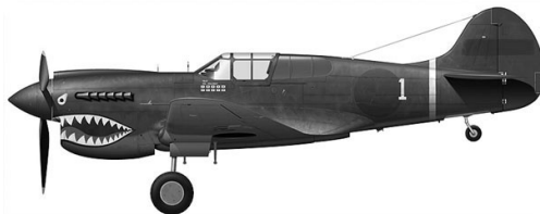
Gen Holloway's P-40

General Bruce K. Holloway Chapter Air Force Association P.O. Box 709 Alcoa, TN 37701-0709