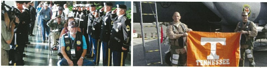
Supporting the Military in East Tennessee

• While this report focuses on dollars, we know that our local military performs vital missions in defending our nation which included a significant number of personnel involved in various aspects of COVID response this past year. In addition, military personnel are valuable members of the community.