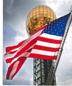
Supporting the Military in East Tennessee